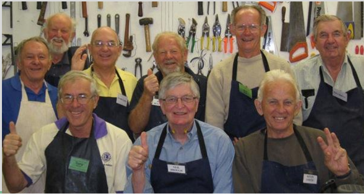
A group of happy 'sheddies' enjoying each other's company and the benefits their Shed has brought to them.